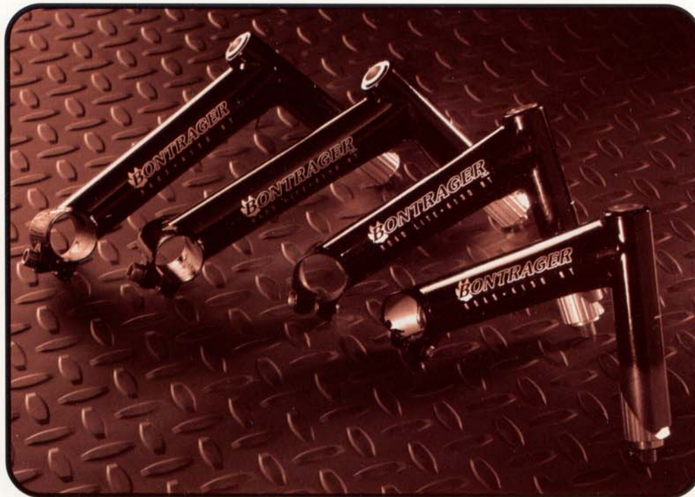
RACE AHS NOT SHOWN