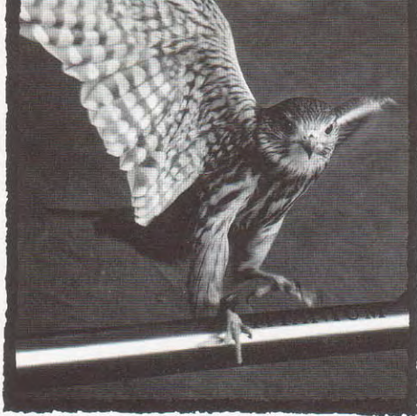
Loyal to the Sport